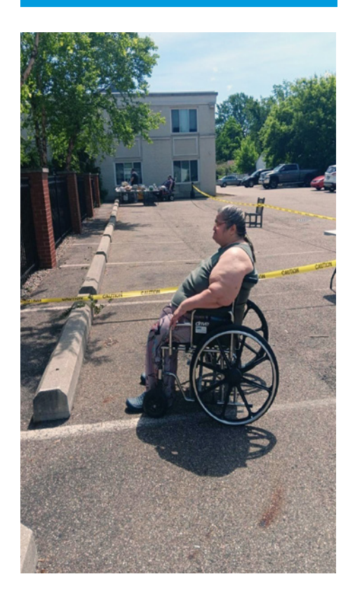
The residents loved sitting outside and grilling out.